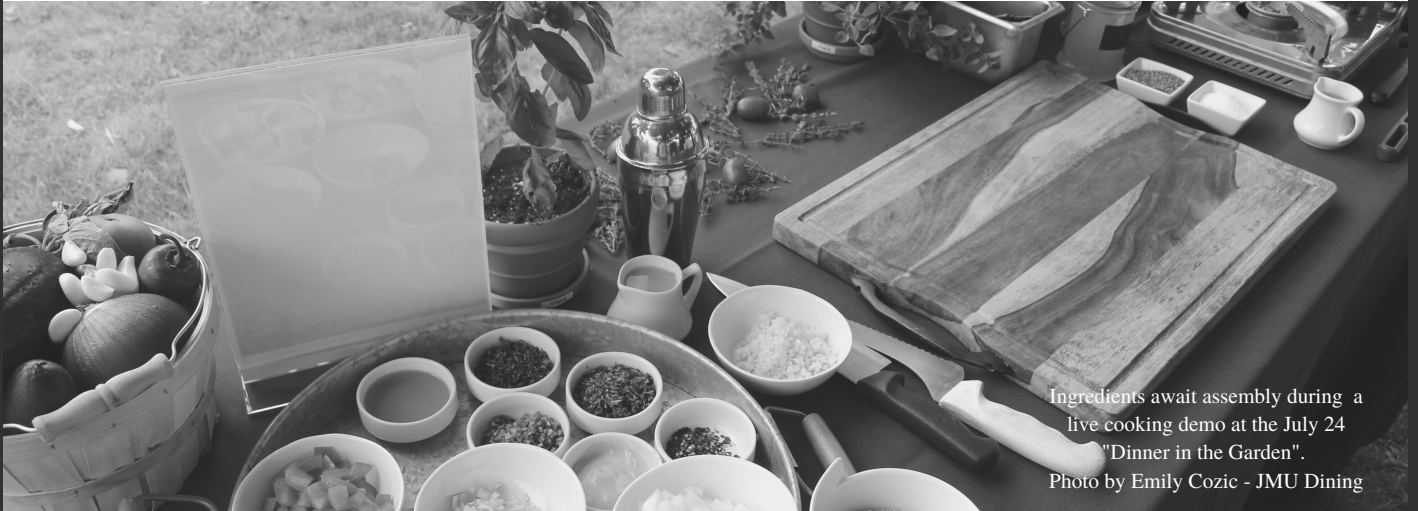
Ingredients await assembly during a live cooking demo at the July 24 "Dinner in the Garden".

News, announcements, and more from the Harrisonburg Redevelopment & Housing Authority