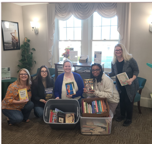
United Bank & HRHA Staff during the final book pick-up for the Book Drive!