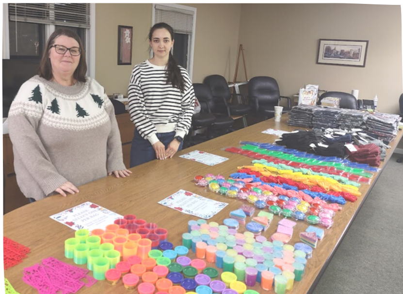
See United Bank volunteers pictured above.

On December 8th, HRHA gathered various toys, books, and winter clothing for 60 children in our FSS families. For the first time, HRHA collaborated with United Bank to have volunteers during this event and to have 60 winter coats donated and available for the children in our Family Self-Sufficiency program!