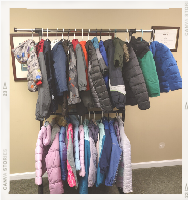
Pictured above is a portion of the winter coats that were donated by United Bank during their Coat Drive.

HRHA would like to extend its thanks to community partners, organizations, and community members for making contributions to this event's success. Your participation brought a brighter holiday season to families in need.